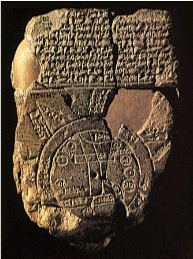
Figure 3: Clay tablet with cuneiform writing. The diagram on the lower two thirds of the tablet is a map of the world, showing the ocean surrounding all land and the Tigris and Euphrates Rivers running through the middle.