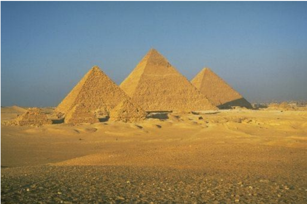
Figure 6: The Pyramids of Giza.