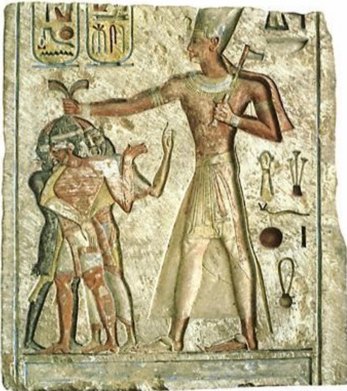
Figure 9: Ramses II in a typical heroic pose, with Nubian captives.