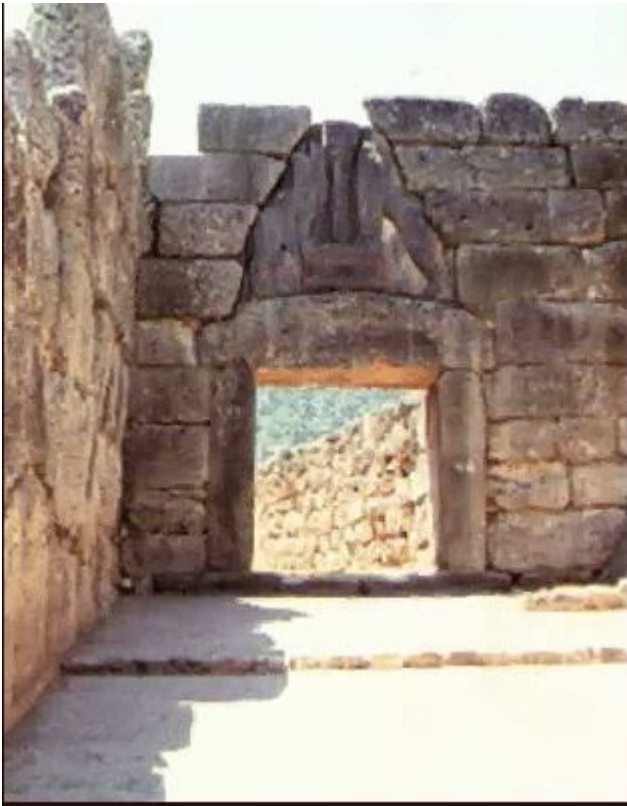
Figure 12: The Lion's Gate of Mycenae is a fine example of masonry in Bronze Age Greece.