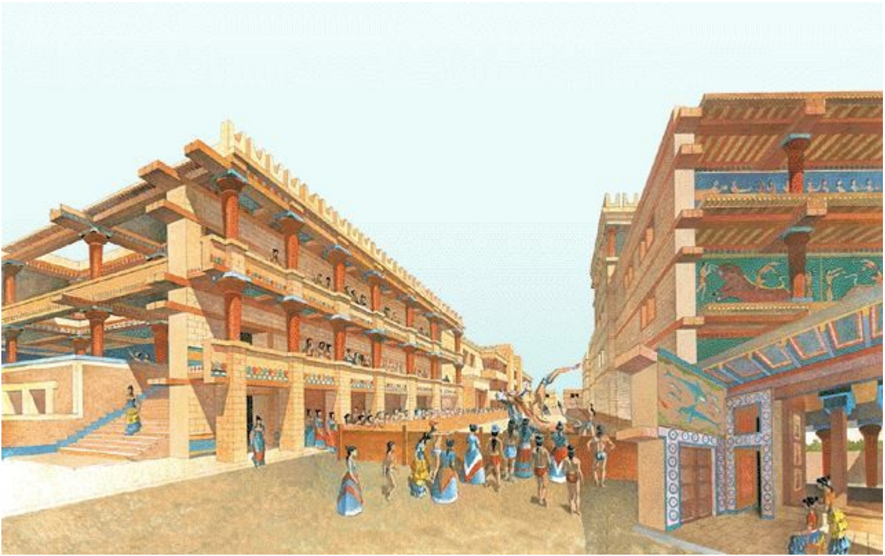
Figure 10: A crowd gathers at the palace of Knossos to watch athletes somersault over bulls. This may have been a religious rite as well as a sporting event.