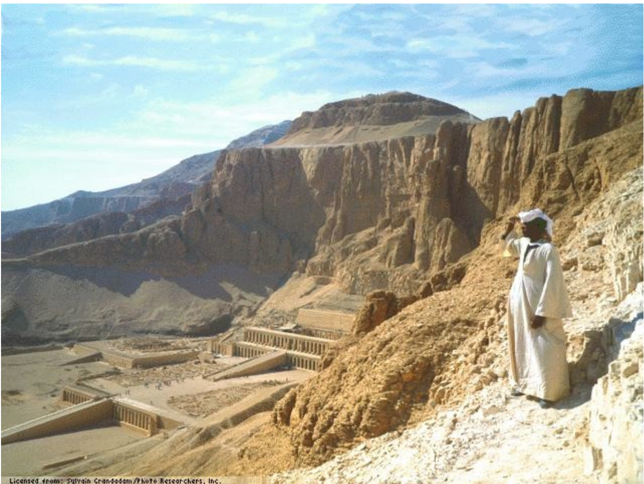
Figure 7: Hatshepsut's temple at Deir el-Bahri.