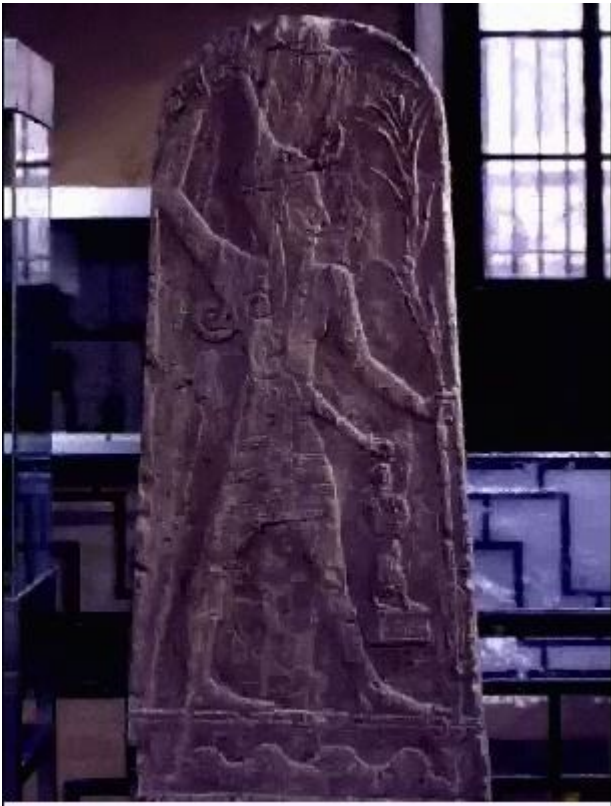
Figure 14: Stela depicting the god Baal.