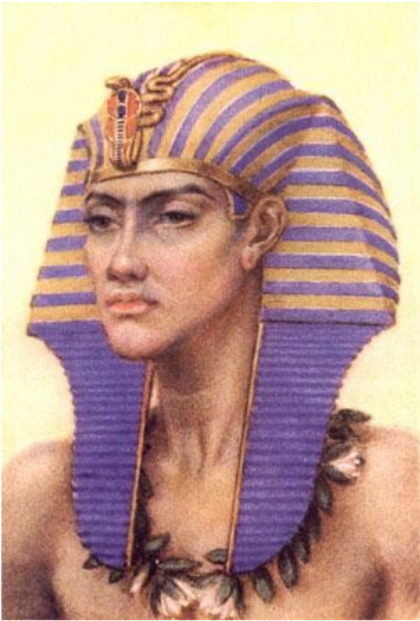
Figure 8: A modern artist's portrait of Akhenaten.