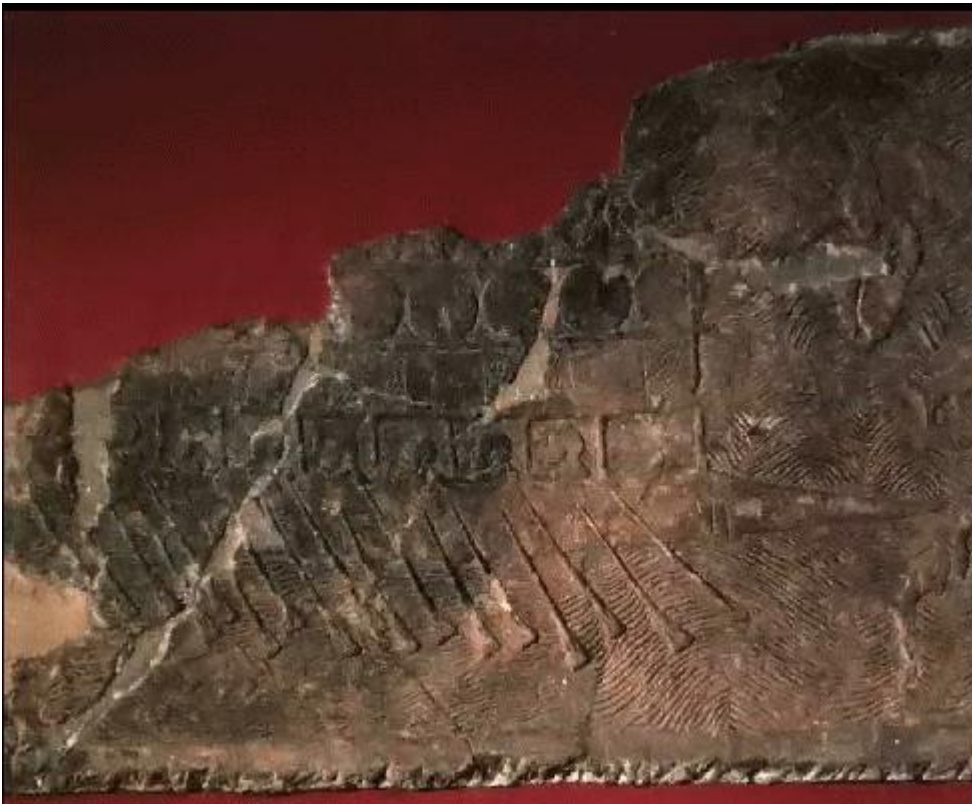
Figure 13: Phoenician warship, from an Assyrian bas-relief, eighth century B.C.