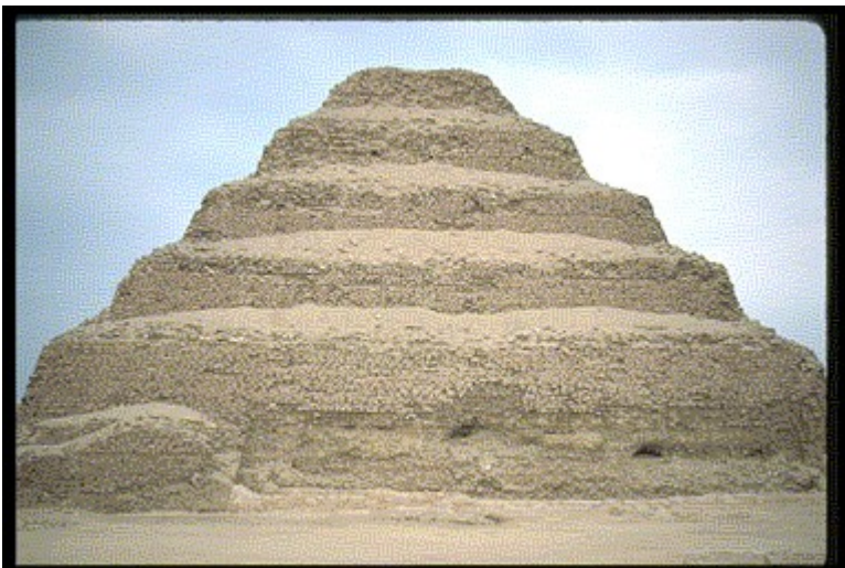
Figure 5: The Step Pyramid of Zoser.