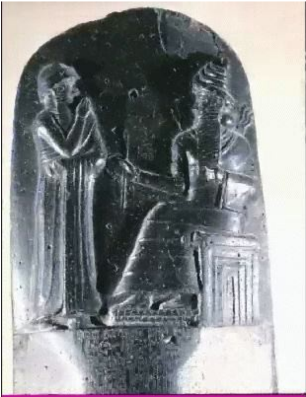
Figure 4: Top of Hammurabi's law code. Here he pays homage to the sun god Shamash, who he claimed gave him the laws.