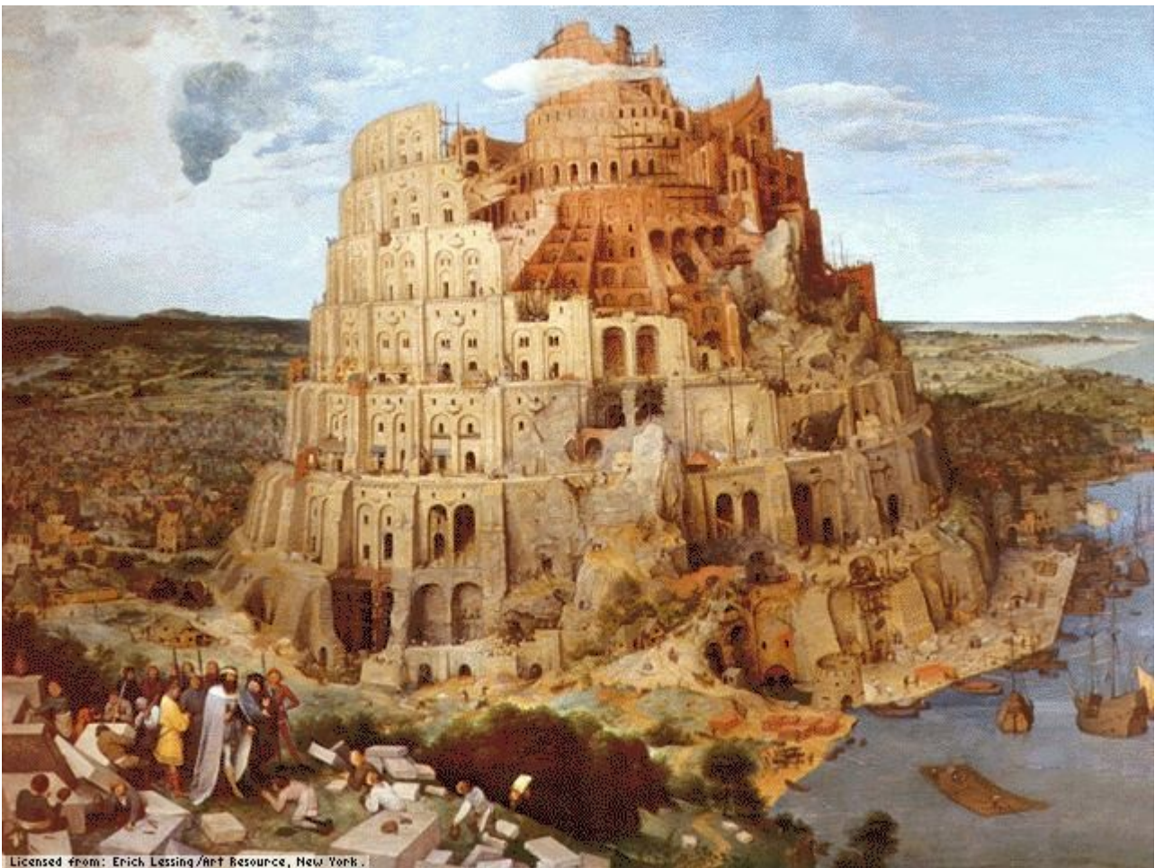
Figure 1: A 16th-century artist's conception of what the Tower of Babel looked like. By Peter Bruegel the Elder.